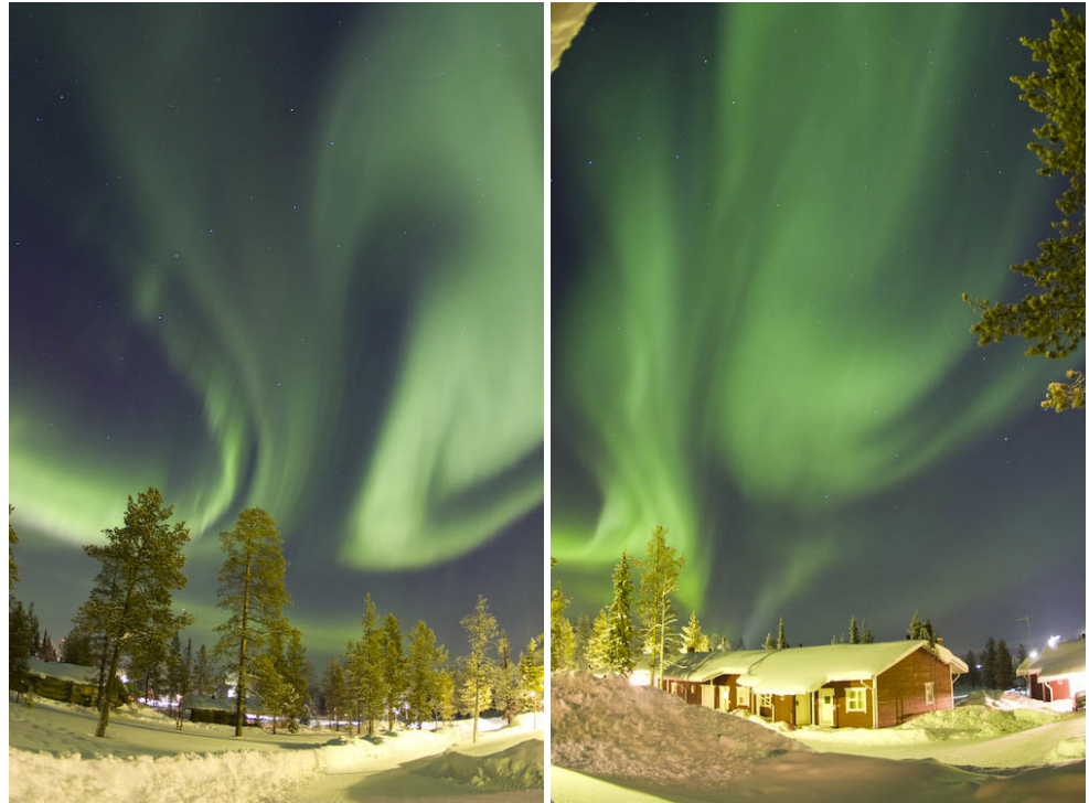
Nicely bended polar lights bands on the eastern sky

A map of Isochasmen (see above) shows you the geographical distribution of aurora probability, i.e. how often auroras can be viewed depending on the geographical location you are. This map will list average values. Saariselkä lies almost optimal for aurora viewings with 100 nights a year (see the map above), Stockholm will still have 10 nights a year and Vienna and Rome will have auroras every 10 years. But a successful aurora viewing will also be influenced by other factors such as the daytime (if auroras happen during the day you will not be able to view them and if they are active in the very early morning hours you're