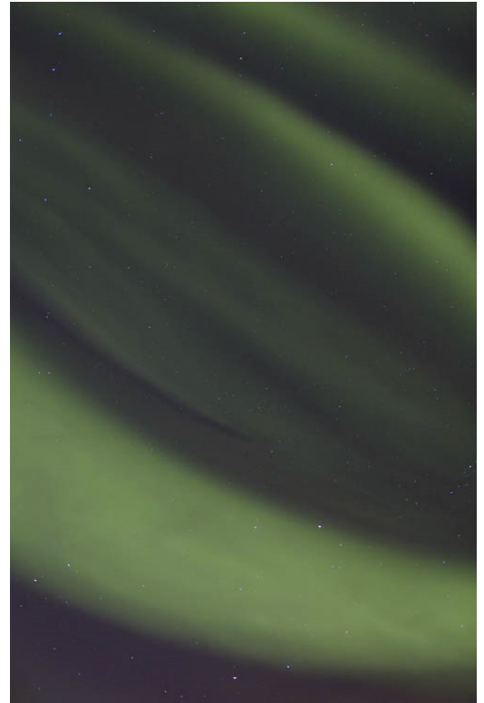
Aurora in the zenith

As mentioned above, artificial light sources can cause many problems when photographing auroras. An additional problem arises if these light sources throw their light on the surrounding landscape which is then captured together with the aurora. This mixed light situation makes finding a good white point setting really complicated and sometimes no good solution is feasible. In these cases it might help to selectively desaturate the landscape illuminated by the artificial light source. A better way is certainly to circumvent the problem beforehand and try to avoid mixed light situations. More details on the colour of light and the problem exposing a mixed light scenario is found in the article The colour of light .