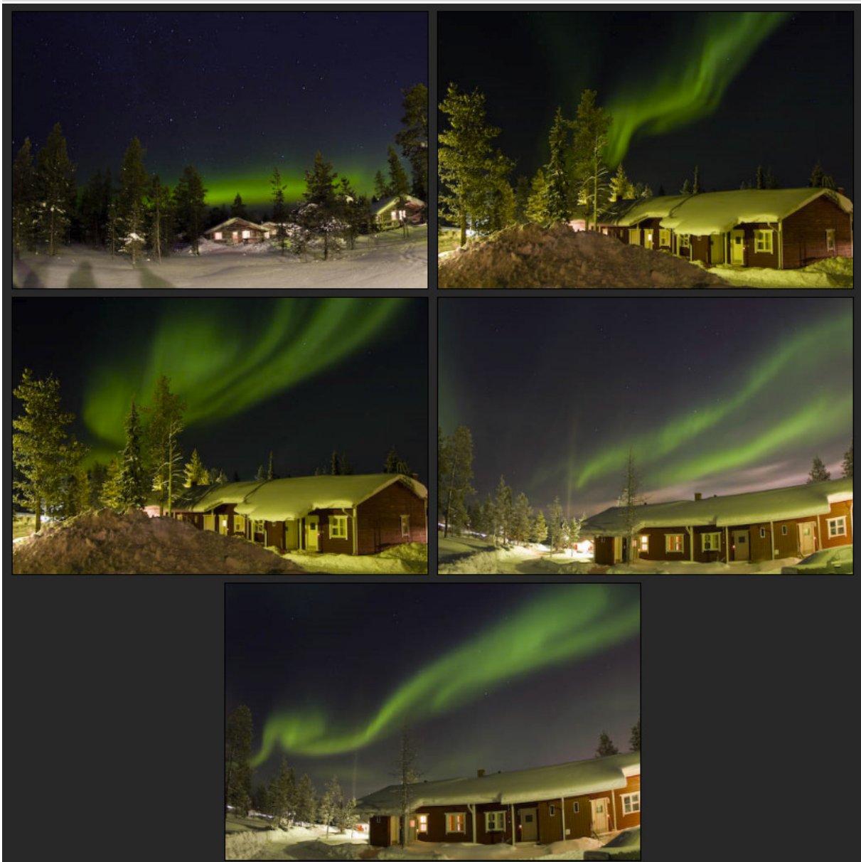
First picture: Activity in the north, subsequent pictures: Bands start to deform, heading south-east

subtraction is required or not. In addition to that, this camera is able to store up to 5 subsequent pictures and use then one dark frame to subtract it from these 5 photos; this will save a lot of time. And because the camera will then decide whether the dark frame needs to be subtracted or not, there is the potential for even more time savings. The low noise experienced might come from the low temperatures. The noise generated by sensors is dependent on the ambient tempera-