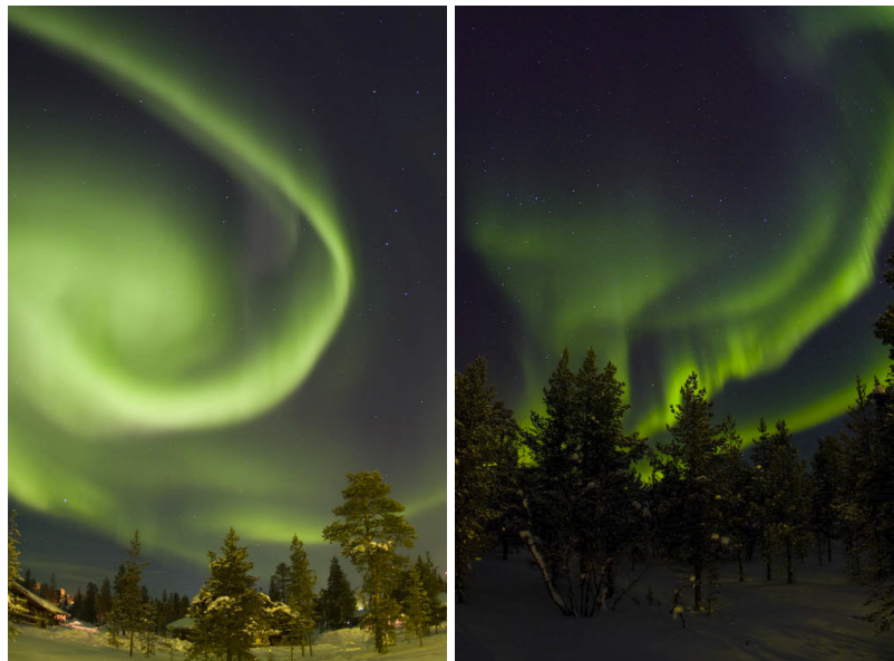
Left: The lights form spirals covering a large portion of the sky, Right: Multiple parallel bands on the North-Western sky

In the early days of digital photography I used a Microdrive to store my pictures. These mini hard disks are prone to low temperatures. Mine gave up working below -15^{\circ}\text{C} . However, this problem is resolved by using standard flash cards. My standard type is the Extreme III card and I never had any issue with them using them in cold temperatures down to -30^{\circ}\text{C} over several hours.