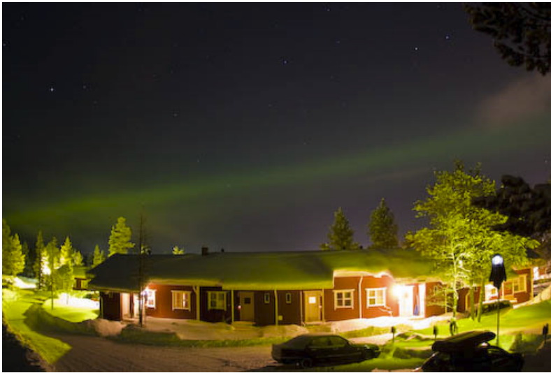
Street illumination can be very irritating when watching auroras; in the picture above you can see how a street lamp on the right handside was muted with a dark blanket

view into the north is therefore recommended. If you are taking pictures it is also good to have an interesting foreground with no bright light sources. In the warmer times of the year, a lake might be optimal possibly reflecting the lights. In the winter this is not an issue as all the lakes will be frozen and covered with snow. But the absence of trees and buildings might give you a good and clear view of the sky. All this is valid for locations in northern Finnish Lapland. Other locations might have higher activities in other directions. Keep in mind that polar light activity is not dependent on the distance from the geographical pole but from the magnetic pole. The geographical location of the pole is changing with time. The northern magnetic pole lies today in northern Canada close to the Island Ellismere-land, the magnetic south pole lies south of Australia.