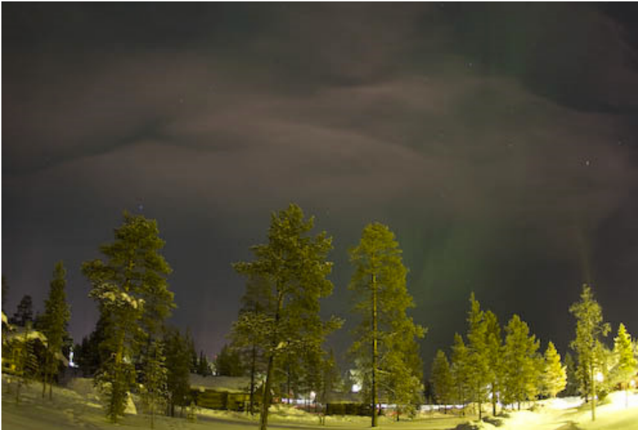
Sometimes Auroras can even be spotted through thin cloud layers

rate method. It is possible that at 15 seconds exposure time the effect is not that big and the differences can be neglected. One thing I do not like about the external dark frame reduction is, that you will not end up with RAW files. Tools like Regim only allow the dark frame to be subtracted in non RAW formats.