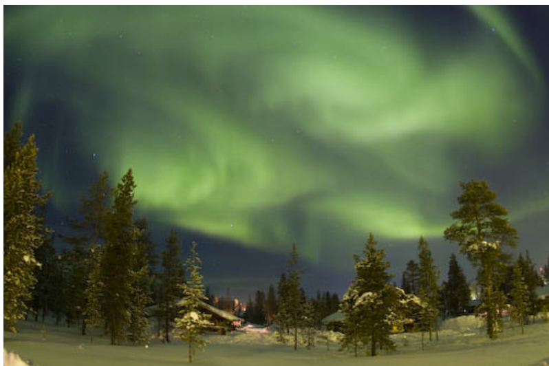
The auroras are expanding over a large part of the hemisphere

an almost continuous activity of polar lights ranging from very dim lights concentrated on a small part of the sky to bright lights covering the whole hemisphere. Typical bands of light from east to west sometimes stood still for over 30 minutes before generating higher activity and starting to move with high speed. The bands generate waveforms and even collapse into spirals. Multiple parallel bands of lights are also possible. Like railroad lines the parallel band will give the viewer the impression as if they merge in the distance. The same applies for parallel cloud bands. This is a purely perspective effect.