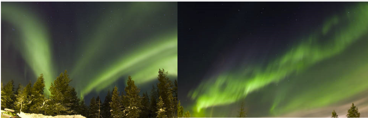
1st picture: Even though these bands are parallel they seem to merge at the horizon, 2nd picture: The bands show activity and start to move, higher altitudes show a changing colour

The spare battery needs to be stored in the warmth of your jacket. The external power supply is the better solution when planning for longer shoots. The longer the time you spend outside the higher the chances you will spot auroras and be successful photographing them. I therefore recommend the use of the external power supply. I wrote an article of how to build an external power supply device on your own. Alternatively there might be one available from your camera manufacturer. The power supply will make you dependent on a AC plug. Another solution is to use an external battery with higher capacity. The battery should be placed on an insulated case. I'm modifying my camera adapter at the moment allowing me to use either the power supply on the AC plug or the external battery. A standard battery decoupled from your camera and stored inside your clothes is already a good solution as the warm temperatures will heavily increase battery capacity. However, you will be leashed onto your camera with this approach.